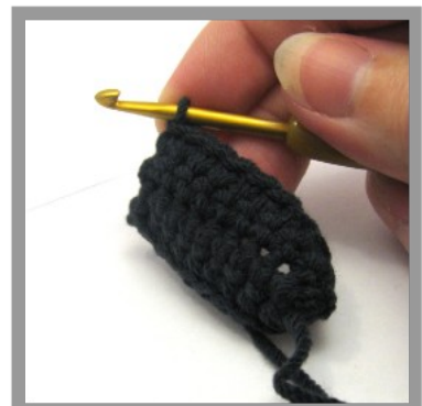
9. Second row completed. Continue in this way to finish the Grim Reaper's hood.