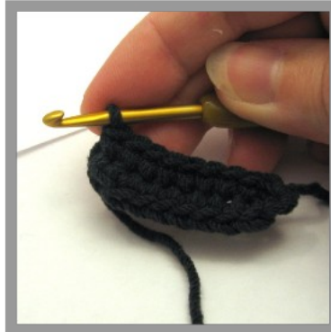
5. First row completed.