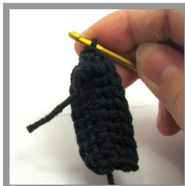
8. ...continue around the end to the other side