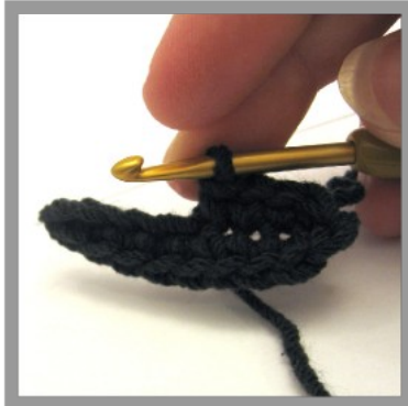
4. ...still working on the other side of the chain