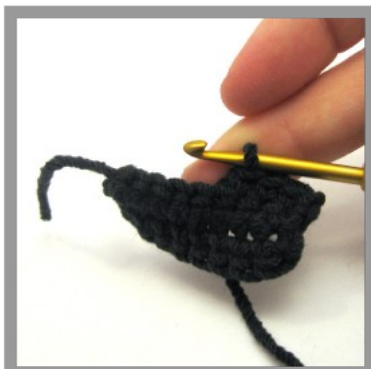
7. Turn around and start your sc