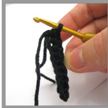
2. sc to the end of the chain. You're going to continue around to the other side of the chain