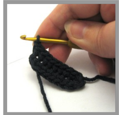
6. To make the next row, start off with a chain stitch